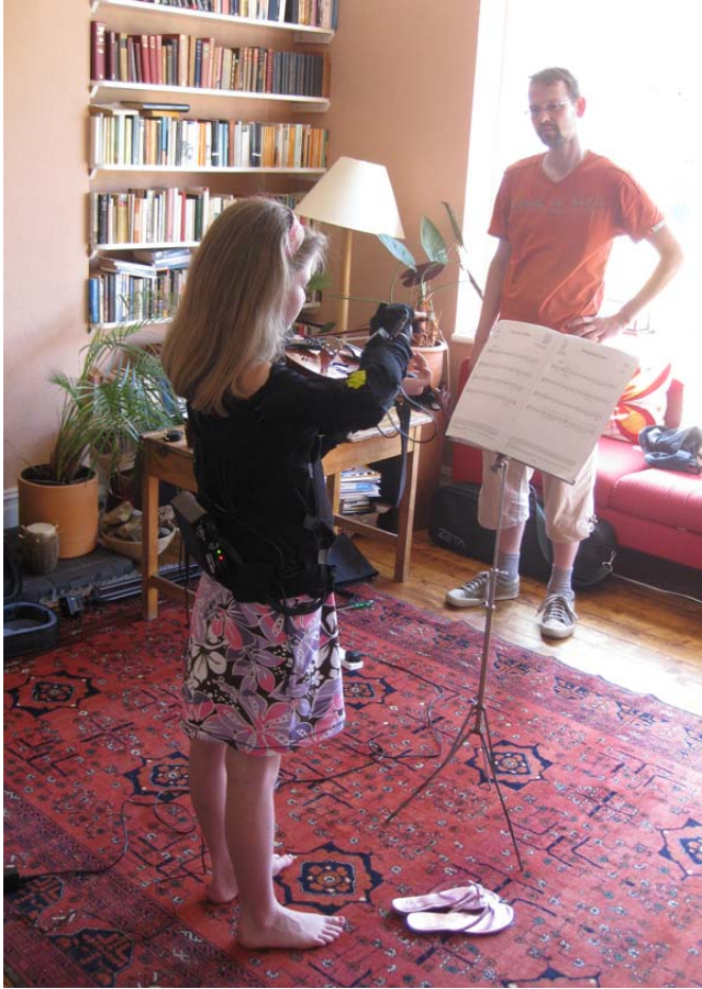
Figure 1. Tracking the bowing action of a young violin player who is wearing the Animazoo IGS-90-M motion tracking system. The movement of her bowing arm and the position of the violin are tracked using 6 inertial measurement units. The motion capture data are transmitted wirelessly to a

system requires only a few minutes to set up, and provides data that is sufficiently accurate for our purposes.