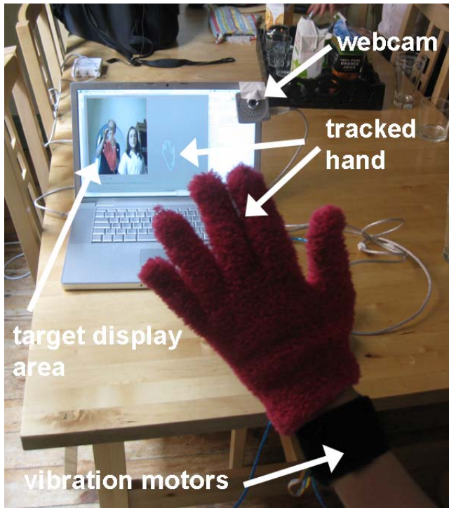
Figure 4. The experimental set up for testing whether two vibration motors could guide arm movements in one and two dimensions. The subjects wear a coloured glove on their moving hand that is tracked using a webcam and computer vision software. Subjects position their hand at a central starting point on the display area and then have to move their hand as quickly as possible to a target location. In some conditions the target position is shown with a brief visual cue. Vibrotactile feedback from two vibration motors provides information about the hand's proximity to the target in some of the test conditions.

subject's movement and how long the movement takes. There are three different conditions: